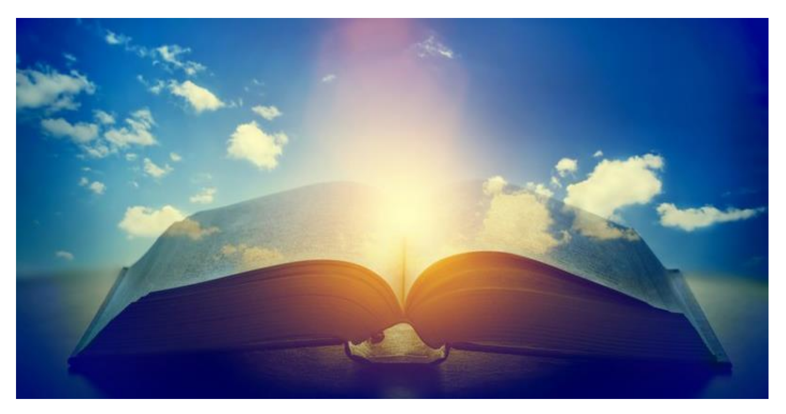
A time of reflection may follow.